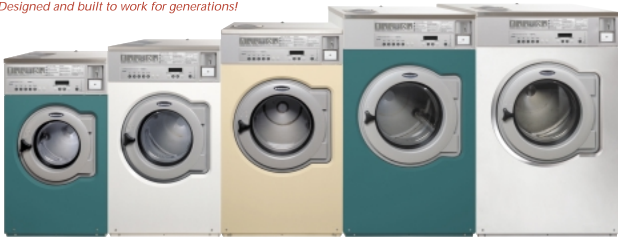
E620 / 20 lb. cap. Junior

Designed and built to work for generations!