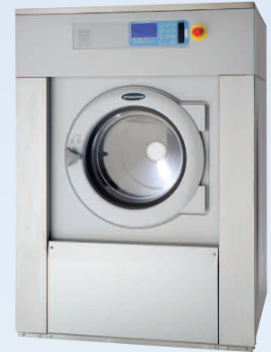
300 & 350 G-Force Extract, Soft-Mount EX Wetclean models. Available in 45, 60, and 75 lb. capacities.