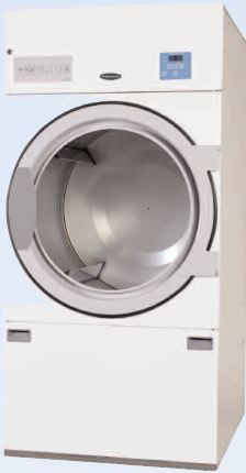
TD Series Wetclean Dryer models. Available in 30, 60, 77, 100 and 135 lb. capacities.

Drycleaners: install the environmentally-safe Wascomat Wetclean System for cleaner, brighter and softer garments - and reduce your operating costs!