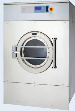
300 G-Force Extract, Solid-Mount EXSM Wetclean models. Available in 65 lb. capacity.