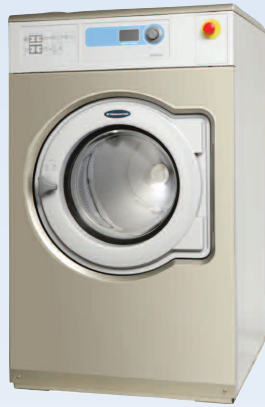
200 G-Force Extract, Solid-Mount SU Wetclean models. Available in 45 lb. capacity.