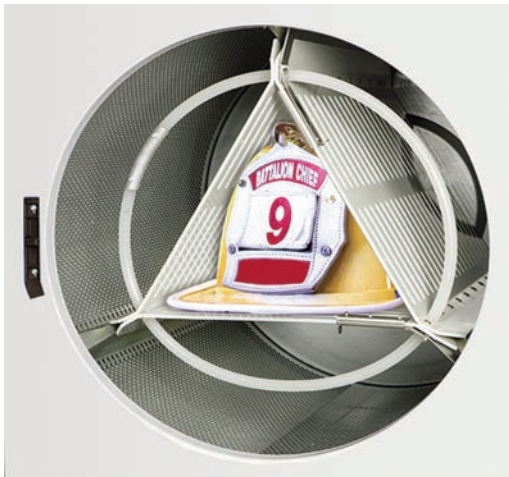
Special dryer inserts available for properly drying protective gear such as gloves, helmets, and masks.

Protective garment manufacturers have specific instructions for properly drying turnout gear – and we can help you meet those guidelines. Wascomat dryers can handle all your regular wash and are available with special inserts for drying gloves, helmets, and masks.